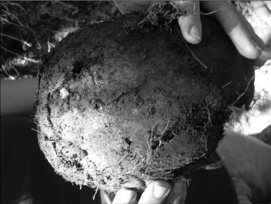
The skull of one of the Irish immigrant railroad workers who died in the 1832 cholera epidemic and was buried in the mass grave at Duffy's Cut. This man, excavated in August, 2009, has a cranium that shows signs of perimortem violence.

the whole community, from which very few individuals are exempt.” The specific symptoms of a “predisposition” of the disease are described: